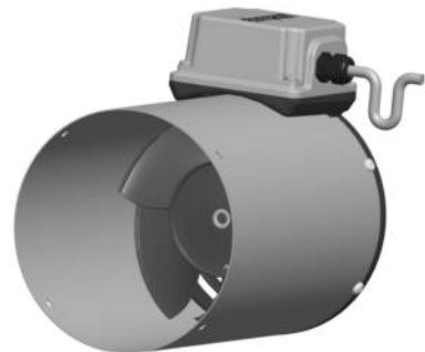
Fig. 1: Cable routing in U-shaped loop

Make sure the cable is routed in a U-shaped loop.